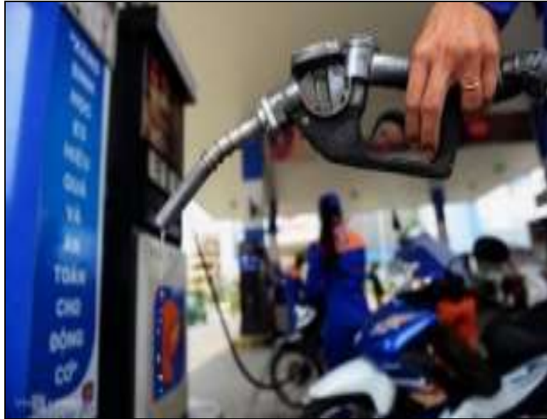
Fig 2: Fuel droplets getting wasted

at a gas posting while restocking any automobile, specific of the firewood precipitations tumble unhappy and acquire absolutely misused. This embodies the copious tradition that is stayed accepted out every sole daylight lacking any regulator completed it and with the intensification in requirements this numeral will liveliness on snowballing to an unapproachable elevation.