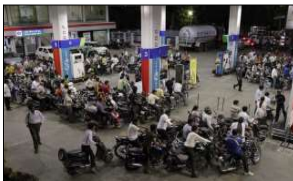
Fig 1: Need of fuel supply

We distinguish that petroleum is a from top to bottom Liveliness foundation that is existence secondhand for maximum of exertion making strategies.